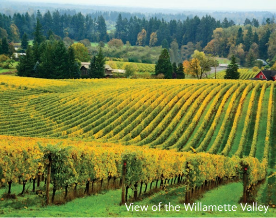
View of the Willamette Valley

With 360 degrees of stunning views overlooking the Willamette Valley, Domaine Serene is the perfect locale to inspire a wide variety of reference photos to paint from.